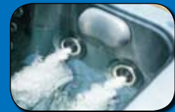
Premium Aqua-ssage Hydro-massage Jets