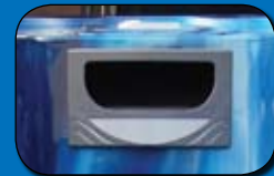
Surface Skimming Filter with Safety Release System