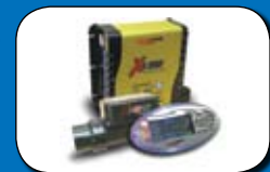
Australian Spa Net Control System