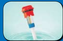
Adjustable "Lasting Scents" Aromatherapy System