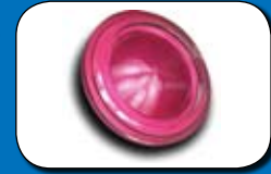
Huge 125mm Diameter LED Underwater Lights