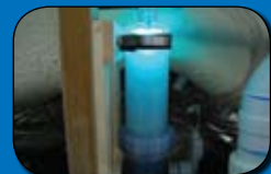
Puresafe Ozone System with Mixing Chamber