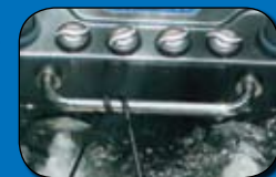
Swim Trainer Handrail