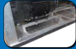
Wrap Around ABS Base