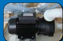
Spa Net "Quiet Flow" High Performance Pumps