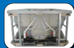
Galvanised Steel Frame with Side & Seat Supports