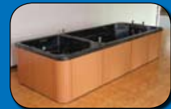
"Thermo-wood" Low Maintenance Cabinet